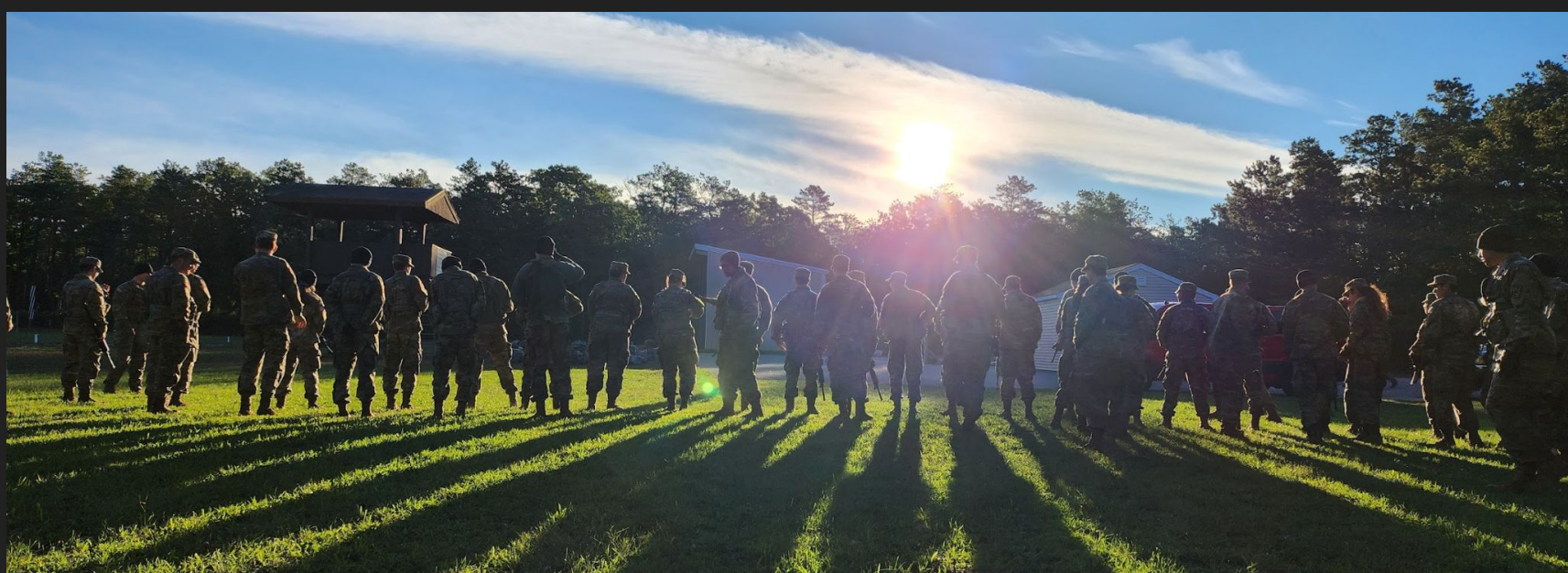
CDTs receive a PMI brief before being issued M4s for the range