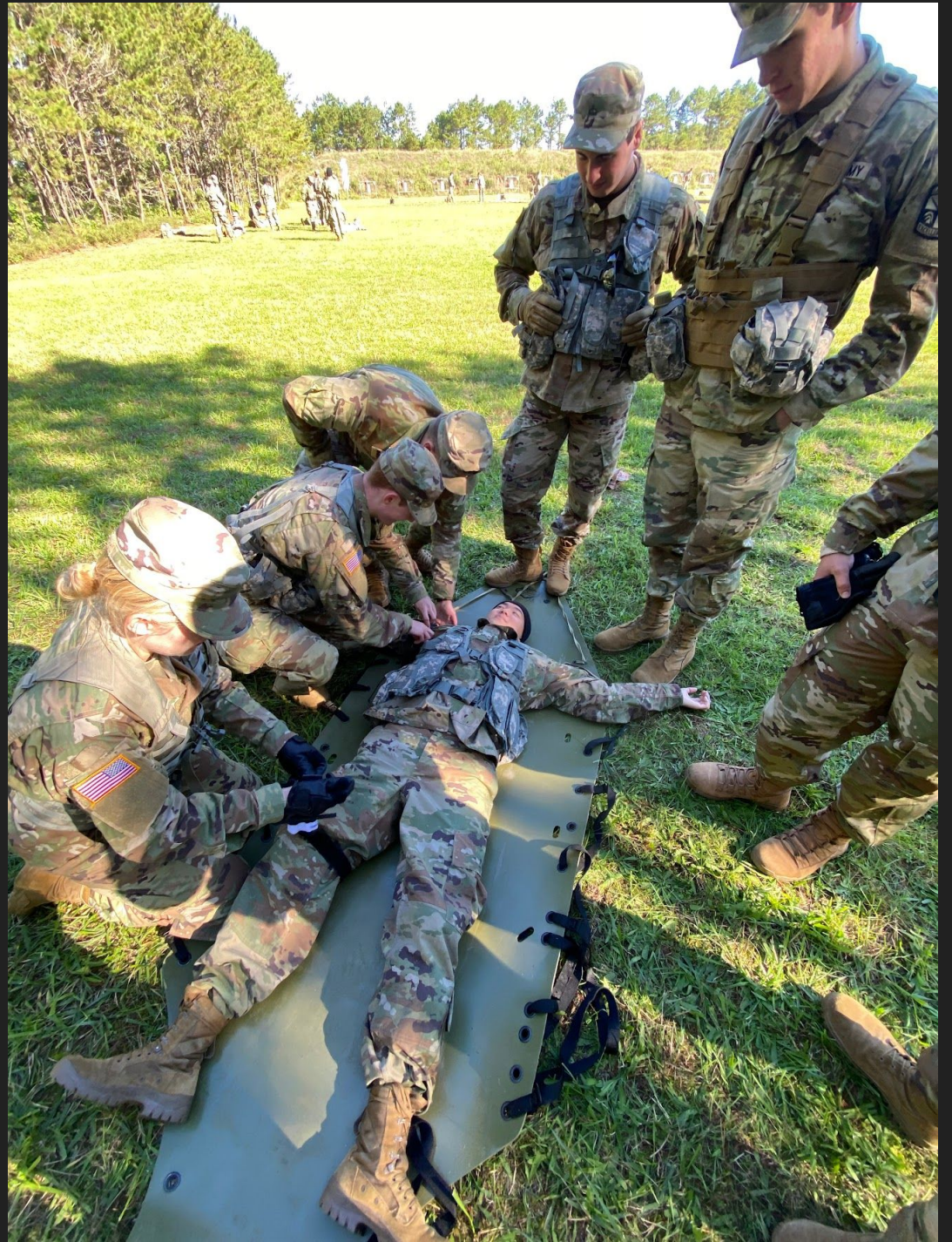
TCCC training at FTX