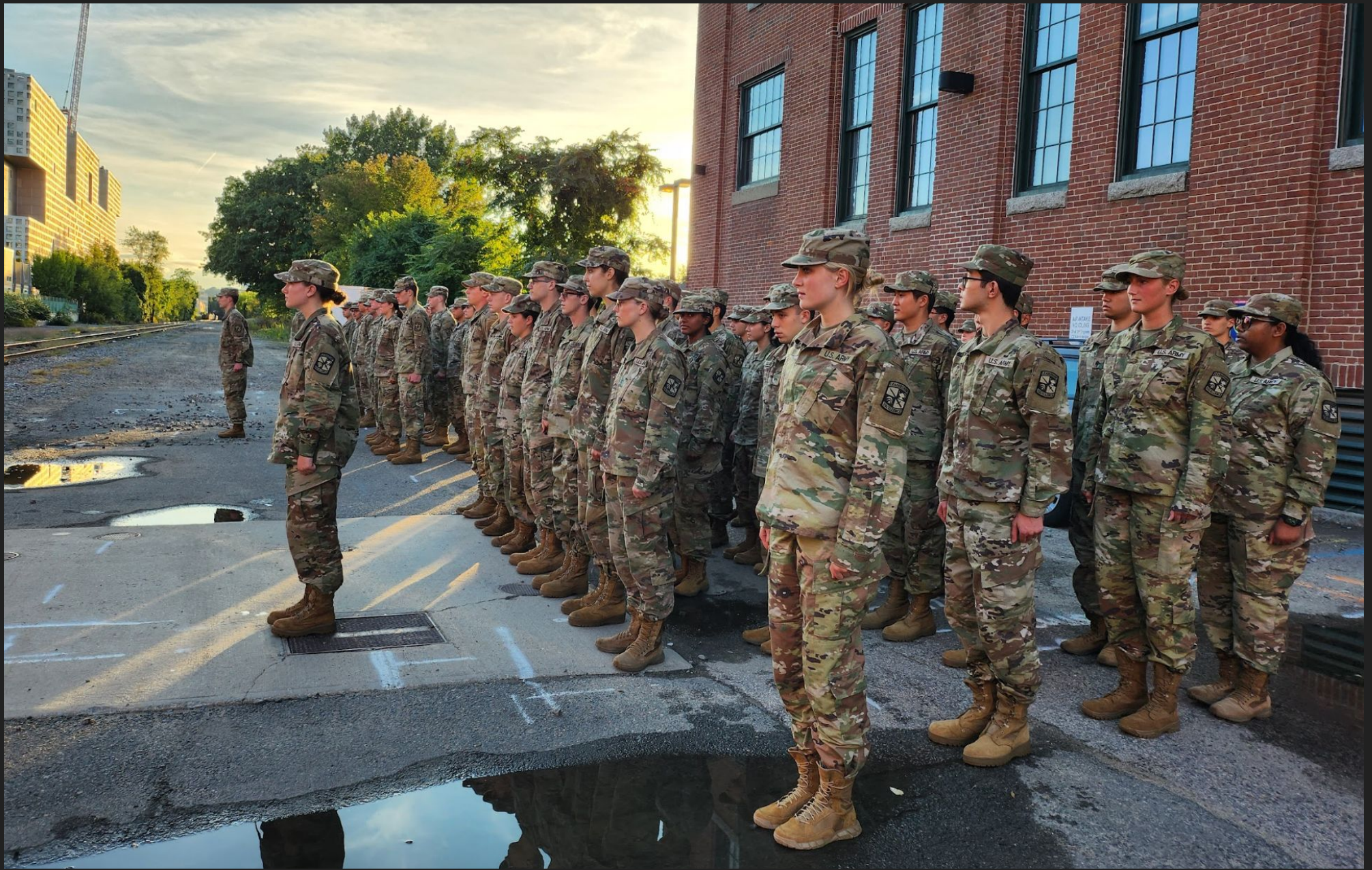
PRB cadets gather behind the unit before LLAB for first formation