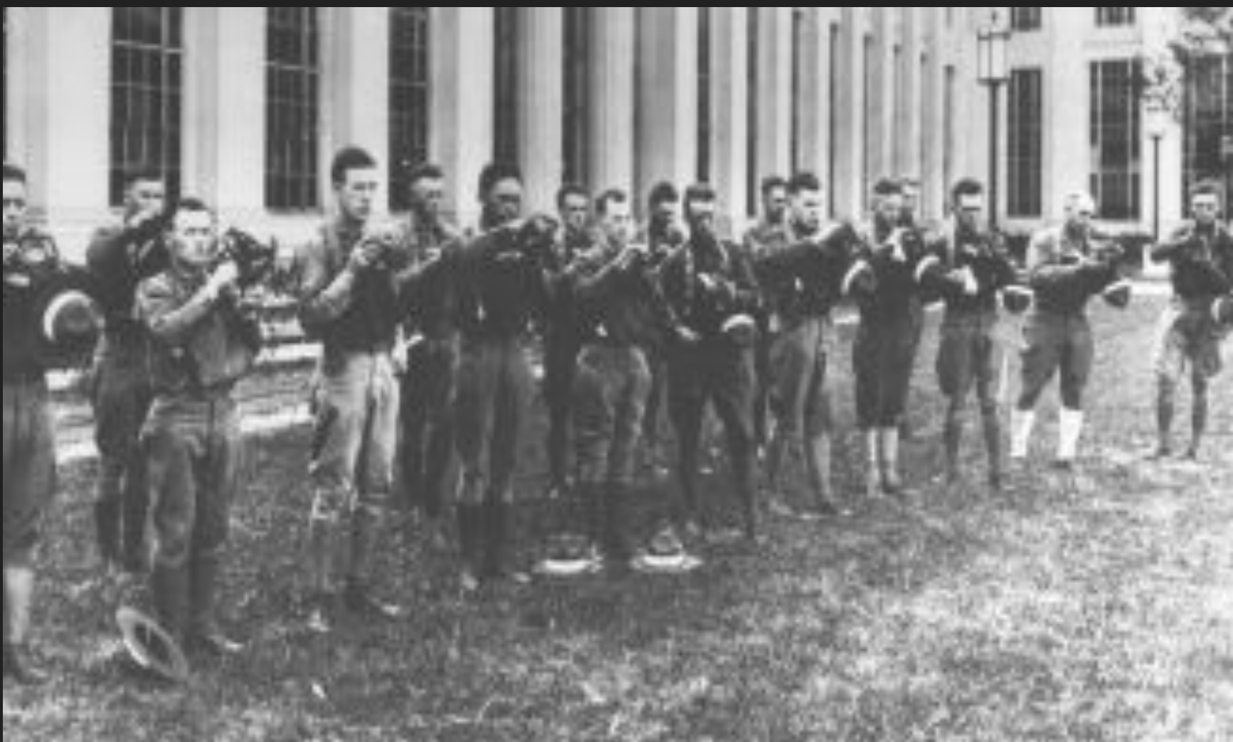
Army ROTC Cadets conduct a gas mask drill on Killian Court in Spring of 1918.

MIT established the Army ROTC Paul Revere Battalion in 1917, one year after the passage of the National Defense Act of 1916. During World War I, more Army Officers came from MIT than from any other school (with the exception of West Point). Of the 1,538 military participants in World War II from MIT, 1,335 were Commissioned Officers. The battalion's history would go on to fill many pages with individual accounts of bravery on the battlefield as well as scientific and technical achievements in military laboratories. Today, our battalion's history is shaped by the wide variety of students from MIT, Harvard University, Tufts University, Wellesley University, New England Conservatory of Music, Gordon College, Salem State University, and Endicott College - yet our history does not stop here. It continues to be written by the men and women of the Paul Revere Battalion, whenever the call may come.