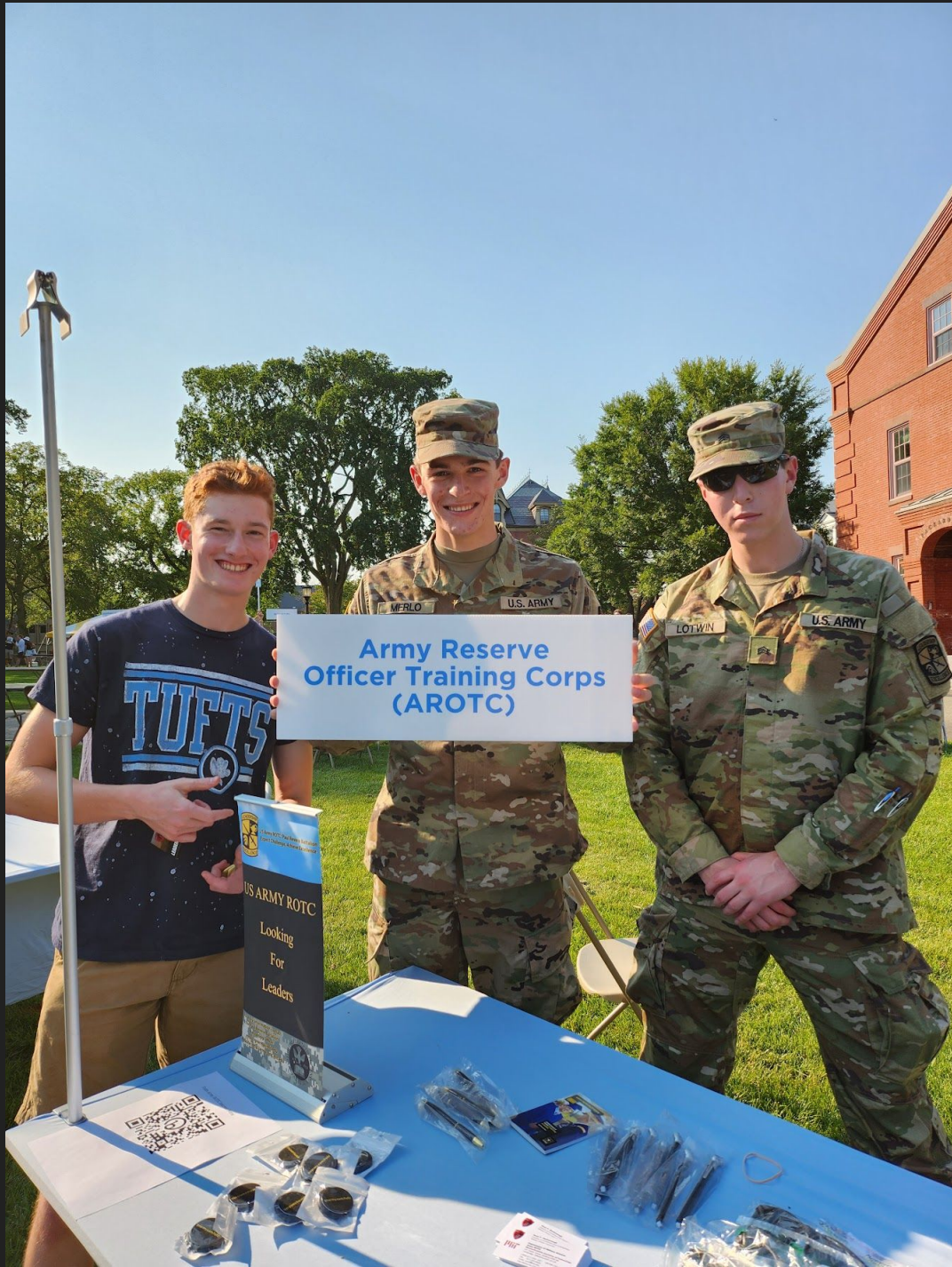
Tufts cadets represent at the club fair