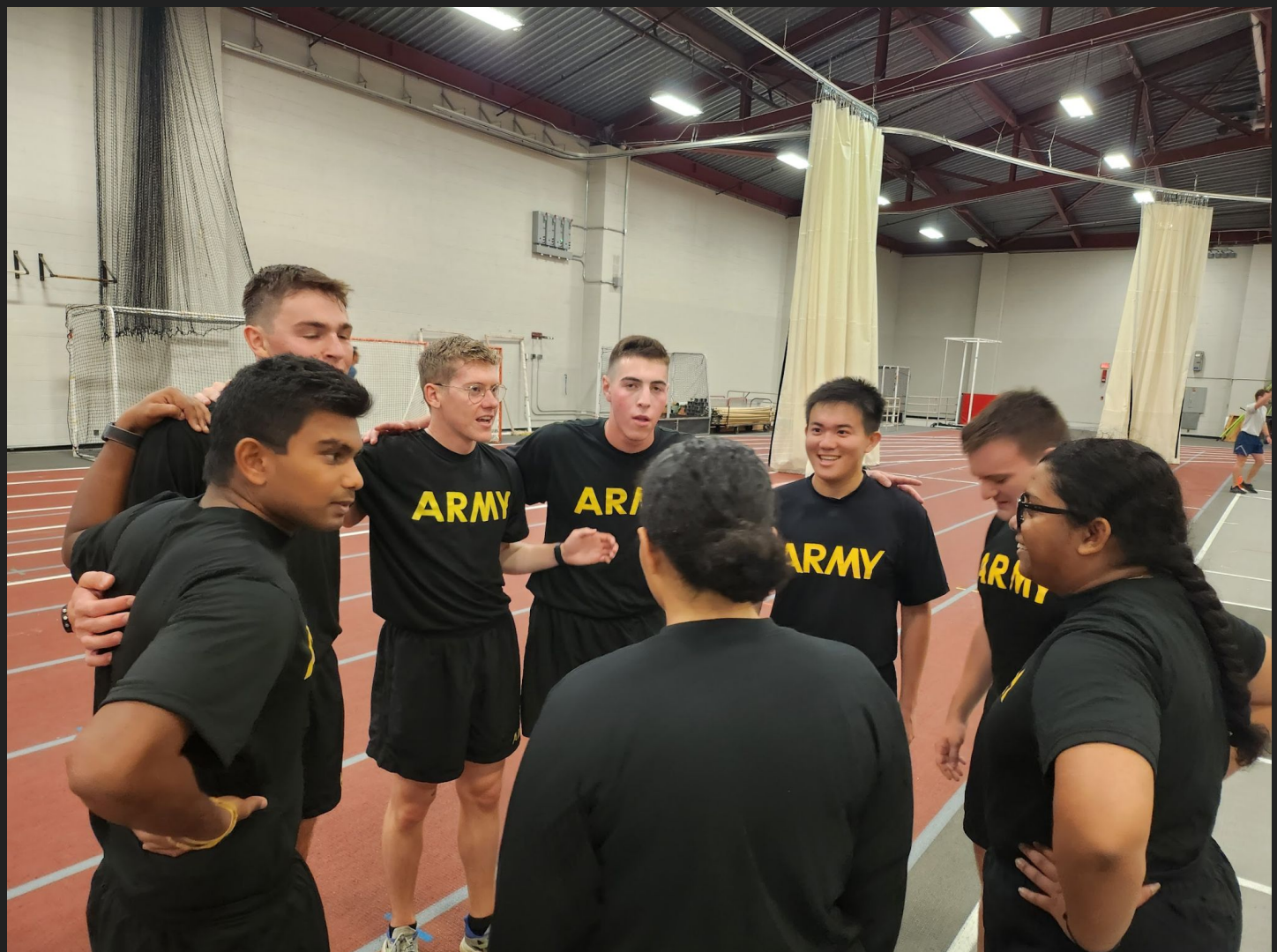
Ultimate frisbee team huddle on Joint Service Sports Day