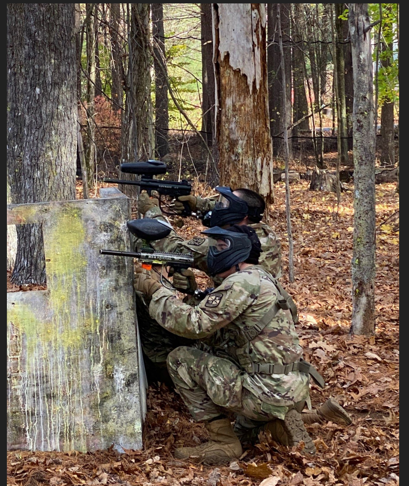
CDTs take cover at Paintball STX