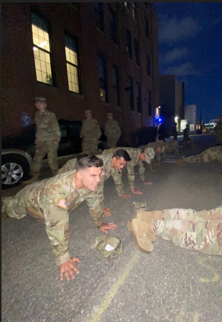
Squad challenge - push-ups!