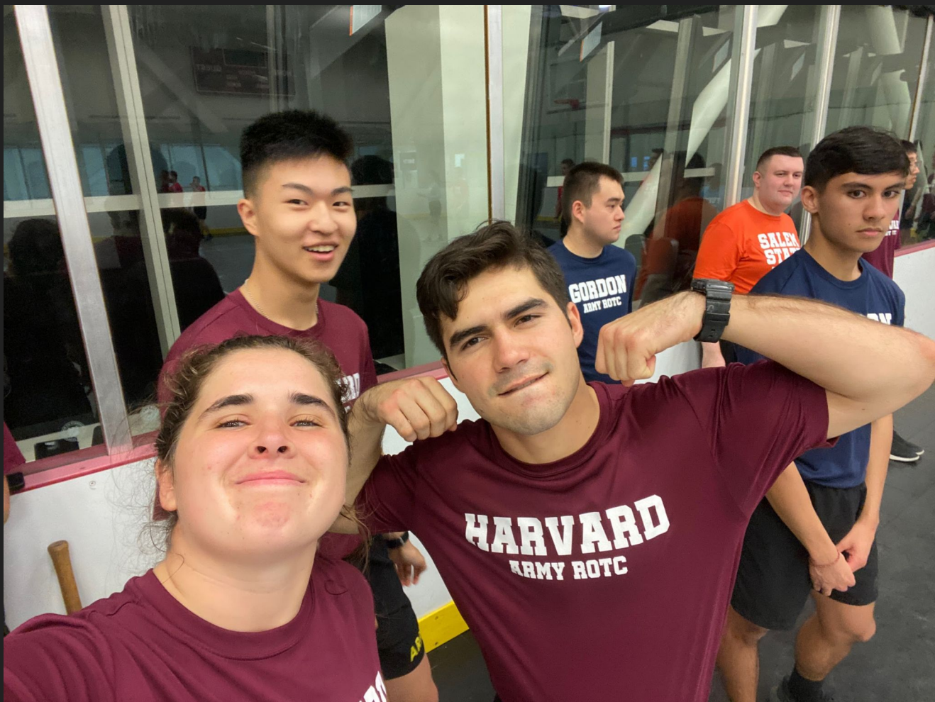
Harvard CDTs show their game face at squad dodgeball tournament