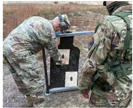
MSG Jordan dropping knowledge