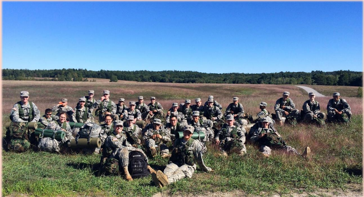
Above: South Shore cadets pose for a post-FTX photo

With all that said, I can definitively say that my experiences in Cabo Verde will help shape my future leadership style for the better.