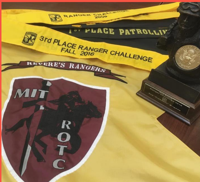
Left: MIT Army ROTC's 3 rd place streamer and trophy on display for all to witness!

No Fear, CDT Anna Page (Wellesley '17) c/Battalion Commander