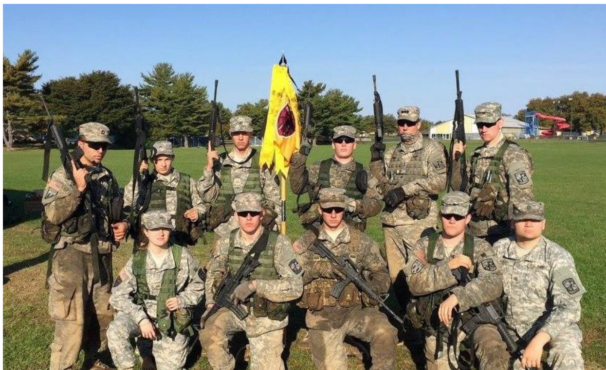
Above: Our Fearless Revere Rangers!