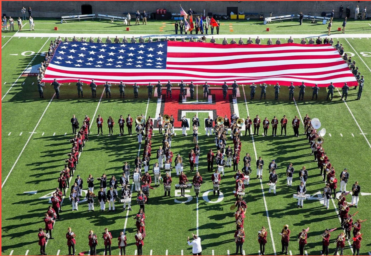
Above: The Paul Revere Battalion presents the colors at Harvard-Yale

As cadets, we must not just help ourselves, but help our peers plow through goals previously perceived as unattainable. This year's Ranger Challenge Team has done this for me. In the following semesters of Ranger Challenge and ROTC, I'm excited to conquer new mountains once thought insurmountable. The climb is significantly easier and the views are sweeter when we climb together.