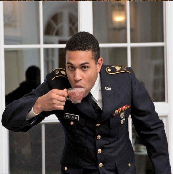
Above: Our brave First Sergeant takes his sip of the grog!